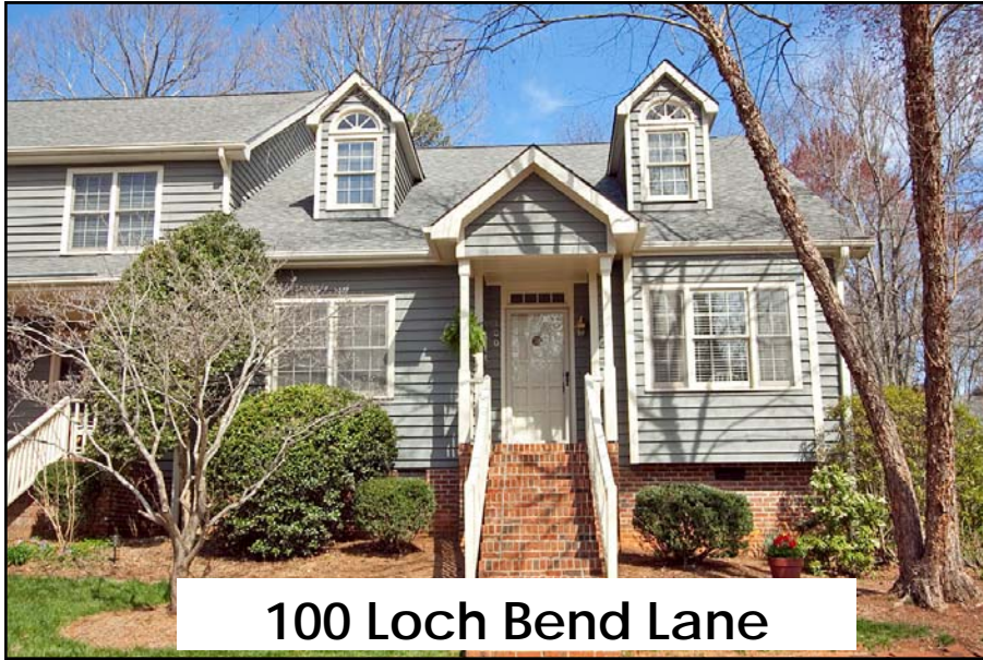
100 Loch Bend Lane

View this home and others at: www.JaneAllenPurtell.com