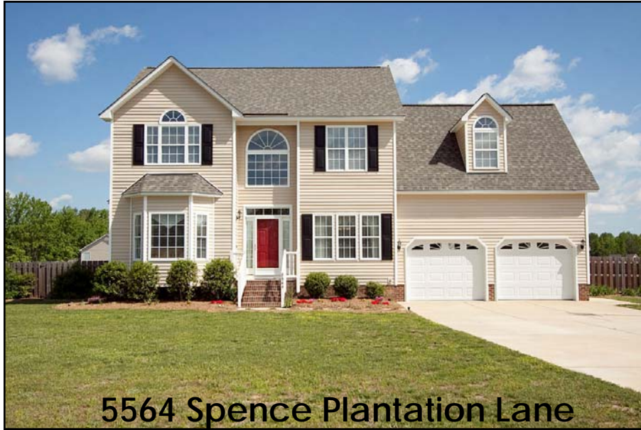
5564 Spence Plantation Lane

View this home and others at: www.JaneAllenPurtell.com